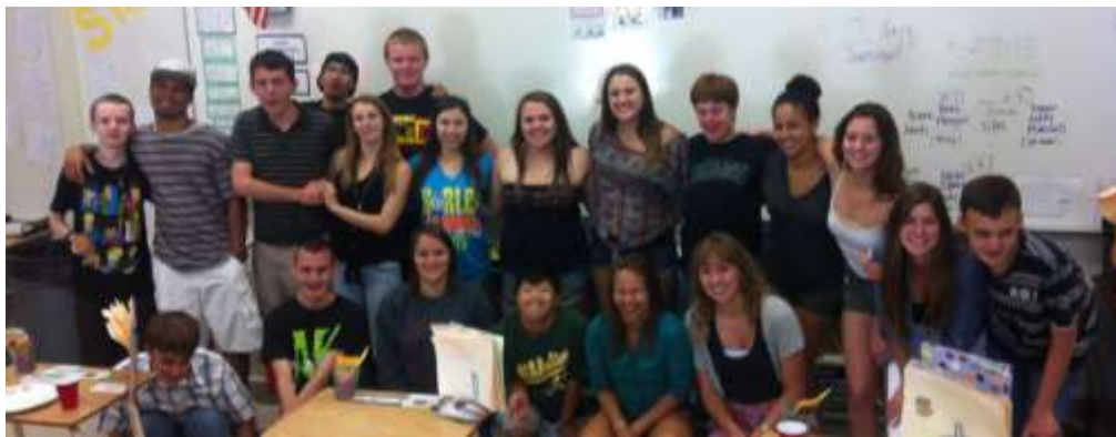
Peer Tutors in Room C-2