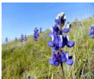
1 st :