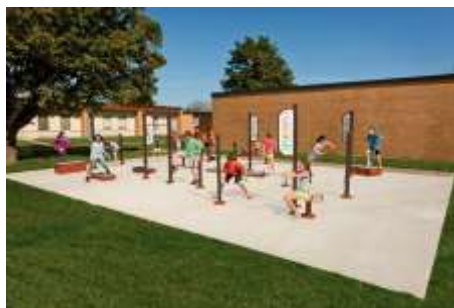
Energi Jr. Par Course